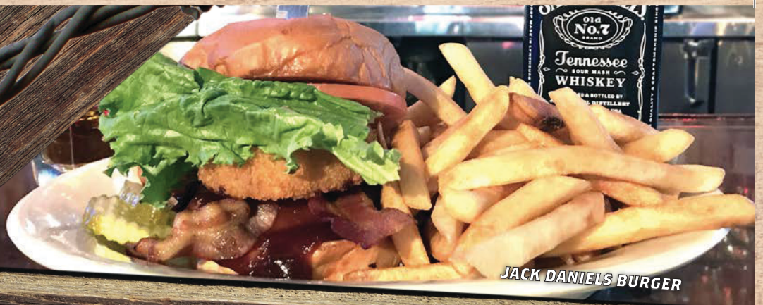
JACK DANIELS BURGER