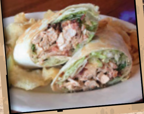
CHICKEN BACON RANCH WRAP