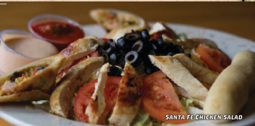
SANTA FE CHICKEN SALAD