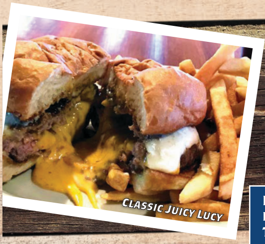
CLASSIC JUICY LUCY